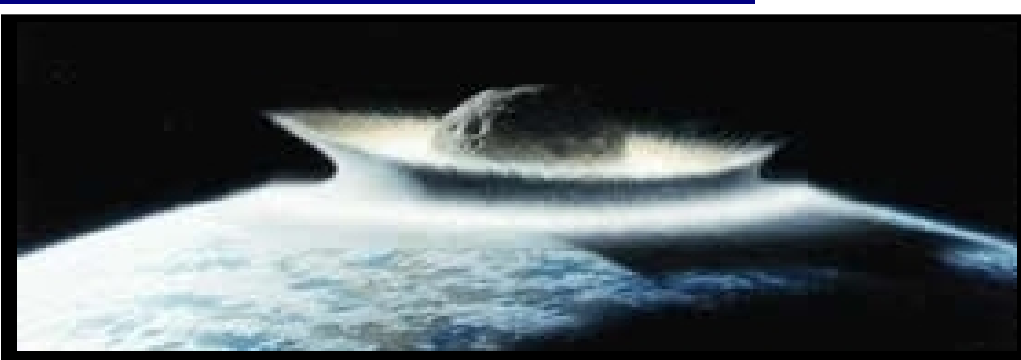
A great star .. fell from heaven .. And the name of the star is called Wormwood, and a third part of the waters became wormwood. And many men died from the waters, because they were made bitter. Revelation 8

Visit our website to hear this program free!