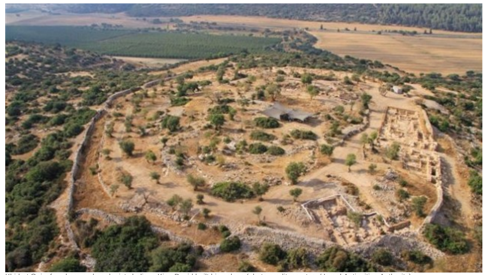
Khirbet Qeiyafa, where archaeologists believe King David built his palace