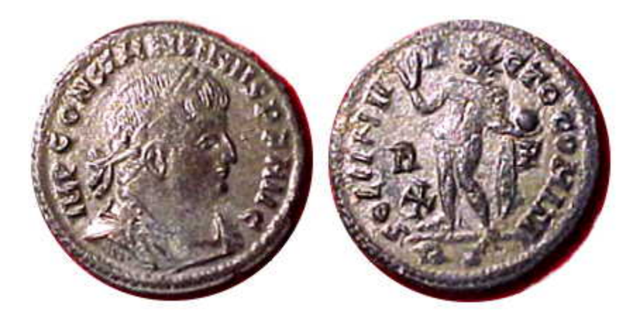
Above - coin of the pagan emperor Constantine I, inscribed on the reverse with SOLI INVICTO COMITI - Sol, Invincible Comrade (of Constantine) with the sun god arrayed with solar crown. Note one hand raised in blessing, the other hand holding a globe. Below - coin of Pope Innocent XII dated 1698 showing Sol Invictus as Christ, inscribed IPSE EST PAX NOSTRA - He is our peace.

Here is one example of how the ancient Sun god became amalgamated into the Roman Church in the form of their Christ figure.