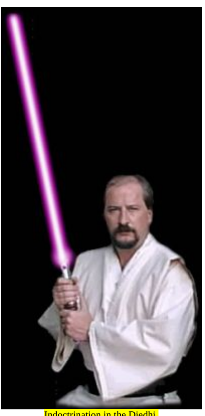
Indoctrination in the Djedhi

Self-generating life principle of the Center--i.e. the transcendent Self). The "Djedi" were the "stable ones"--wisdom keepers of one mind and one spirit who, as initiates of the Osirian mysteries, comprised the living, terrestrial body of the archetypal, celestial Osiris The word Wizard comes from those who held the Staff of Power, which was called the WSR (Wassar). Osiris was the Life Force within creation, his backbone the Djed, or Djedhi, hence the "Force" of the Jedi Knights of Star Wars. Osiris was called Wassir. The Wasser staffs were electrical conductors of power, hence the Wizzards were Wassirs of Osiris .. using Wasser staffs as conductors of occult power... Obviously, the Wasser staff becomes the "lightsaber" and the Wassar Djedi initiates become the Jedi in the Star Wars Universe.