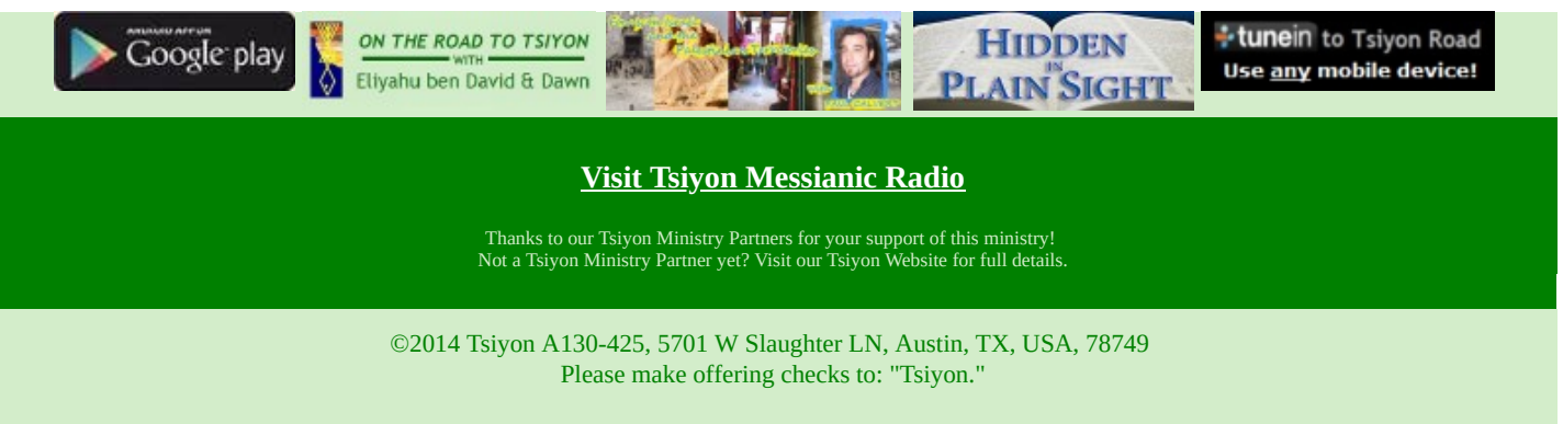
You may leave feedback, prayer requests and donations online here.

Need to talk to us? - In the USA and Canada just call us toll free at (888) 230-2440 for help. Internationally, email us and we will arrange a phone or Skype call for you.