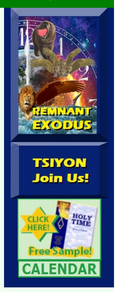
Keep Tsiyon Road on the air.