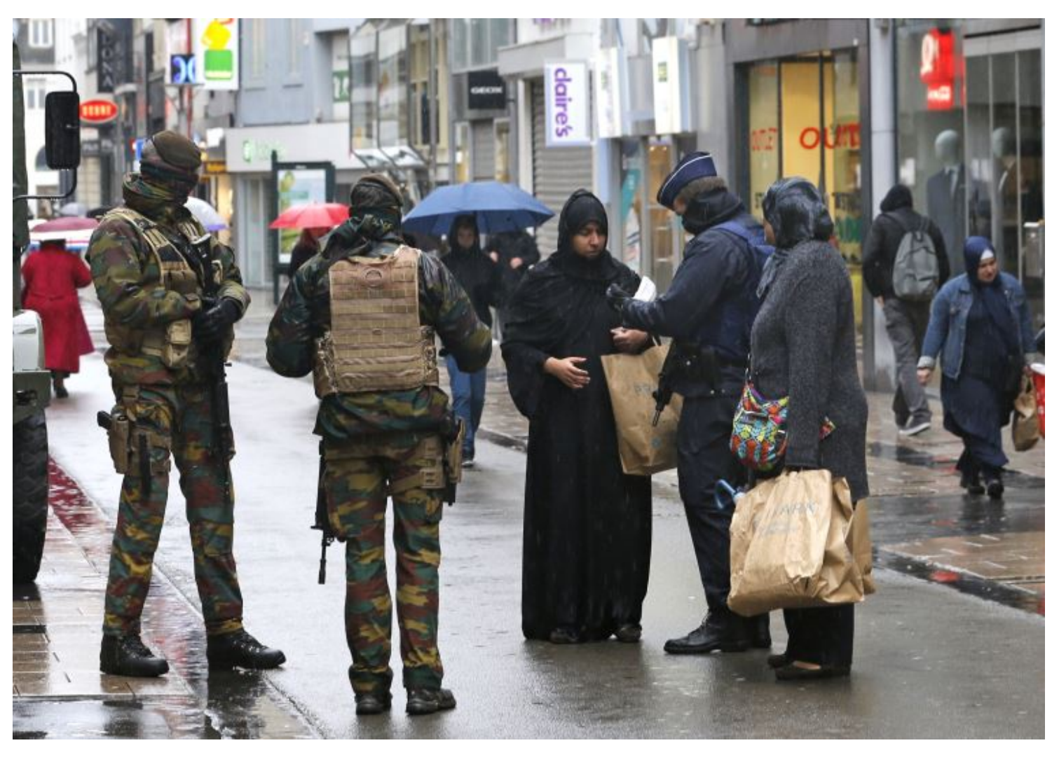
Belgian soldiers and a police officer control the documents of a woman in a shopping street in central Brussels, November 21, 2015.

Synagogues in Belgian capital closed on Shabbat for the first time since World War Two, Rabbi Avraham Gigi tells Israel's radio 103 FM.