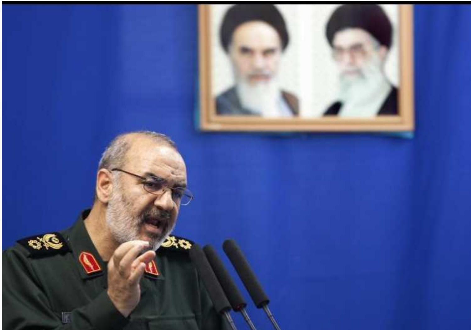
Hossein Salami, deputy head of Iran's Revolutionary Guard.