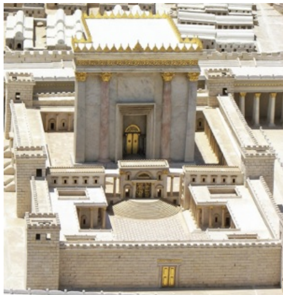
2016 was the golden anniversary of archaeologist Michael Avi-Yonah's model of Herod's Temple. The model is now housed in the Israel Museum.

The Temple was called by the name of the one and only True God. It was a place of worship for all the people of the world - not just Israel. When the Temple of Solomon was no longer functioning in a way to fulfill that purpose, it was destroyed. Later, a Second Temple was built by an earnest remnant for the same original purpose. Hundreds of years later that Second Temple was expanded and rebuilt by King Herod.