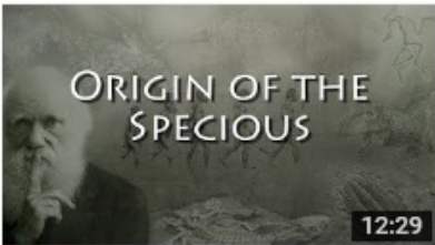
Origin of the Specious (#3)

See: Origin of the Specious - now showing on YouTube.