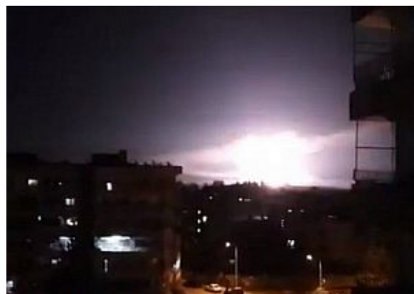
An explosion, reportedly during Israeli airstrikes near Damascus, Syria, on January 21, 2019.

Earlier this week, Iran’s military chief of staff indicated Tehran was preparing to adopt offensive military tactics to protect its national interests, an apparent reference to its posture in Syria toward Israel.