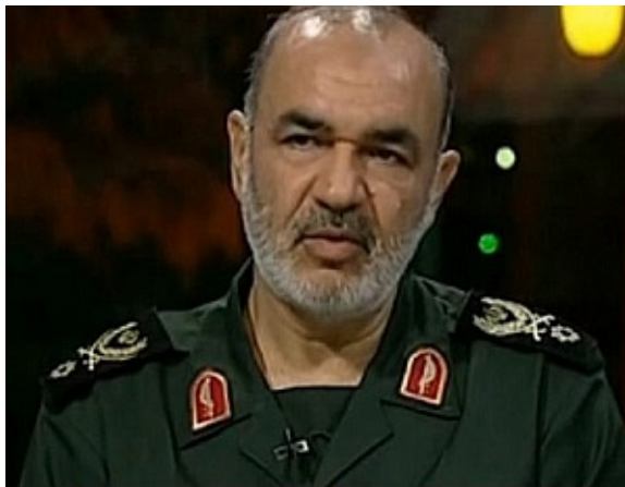
IRGC Deputy Commander Hossein Salami.

The deputy head of Iran's Islamic Revolutionary Guard Corps said Monday that Tehran's strategy was to eventually wipe Israel off the "global political map."