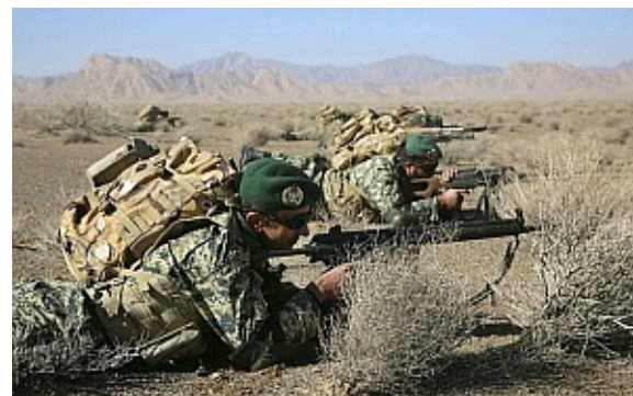
In this photo provided Friday, January 25, 2019, by the Iranian Army, soldiers take position in an infantry drill in the central Isfahan province, Iran.

“To protect Iran, the armed forces no longer need asymmetric approaches, and we are at a stage where we can defend our homeland... by using good offensive approaches,” he said, according to