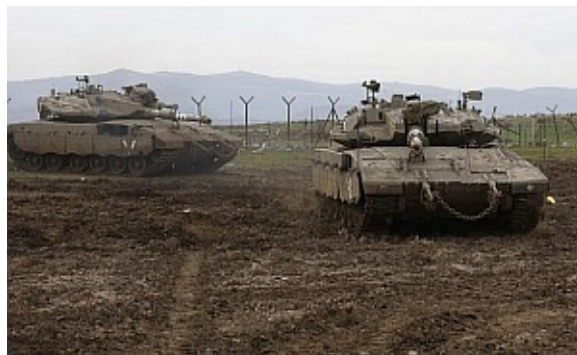
Israeli army Merkava tanks take positions on the Golan Heights, on January 20, 2019.

See video of BattleCry 2018! - BattleCry 2018 was recorded and is available for you to view the fabulous content, which includes testimonies, words of encouraging, inspired teachings, and more--you will not want to miss this!