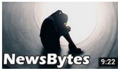
Demonic Possession is Real? - News Bytes