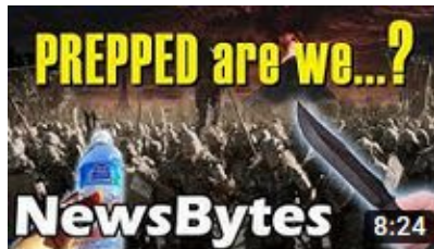
Prepping, Right or Wrong? - News Bytes

To see all of these, and others that are coming out every week, click the Tsiyon graphic below, and please subscribe at YouTube to our channel. Together we can help Emily get these out to the people who need to see them!