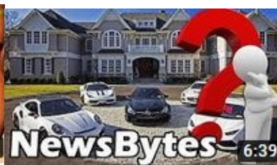
Cars or Kingdom? - News Bytes