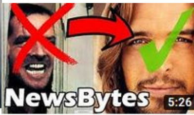
Have You Lost Your Mind? - News Bytes