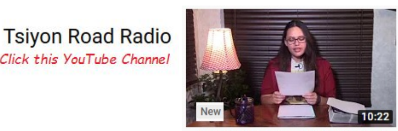
Heroic Nature - News Bytes