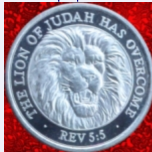
..Get the Silver Kingdom Shekel