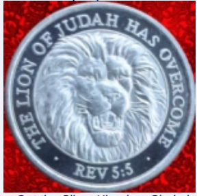
..Get the Silver Kingdom Shekel