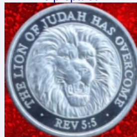
..Get the Silver Kingdom Shekel