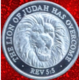
..Get the Silver Kingdom Shekel