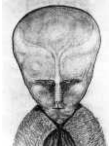
1918 - "Lam"