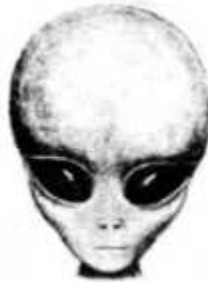
Today - "Grey"