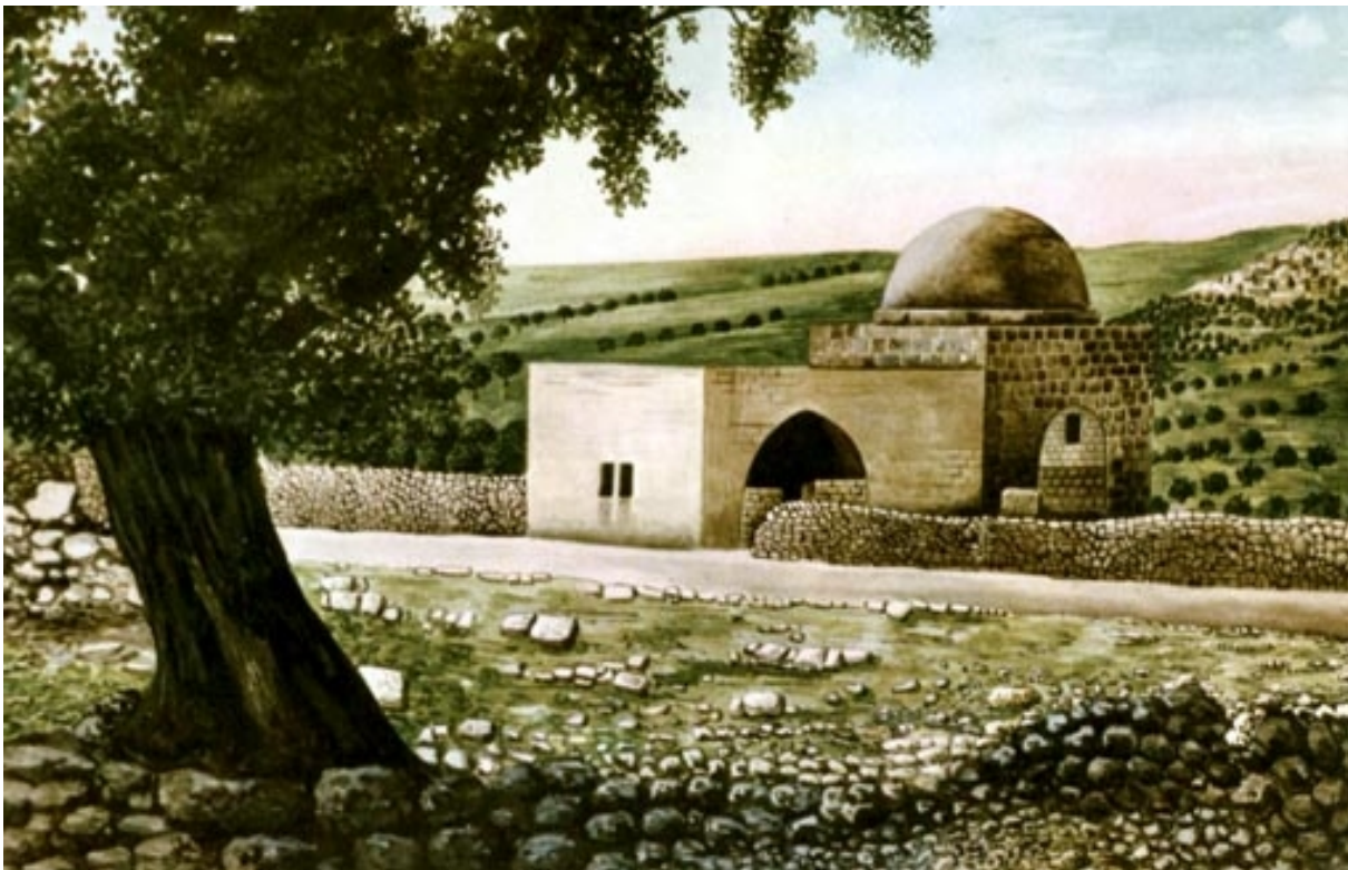
A painting of Rachel's Tomb as it looked from the late 1800s to the 1990s. The brick cube with the dome was constructed around 1620 by the Ottomans; the white extension was added in 1860 by Sir Moses Montefiore.