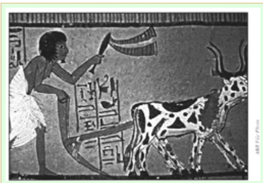
“The Egyptians...worked them ruthlessly. They made their lives bitter... with all kinds of work in the fields.” (Ex 1:12–13). A plowing scene from the Tomb of Sennutem, Thebes, Egypt, 18th Dynasty.

First, let it be said that dismissing something on the basis of a lack of evidence is a dangerous business. Today, we have very few of the written documents composed in the Ancient Near East. What we have reflects accidental preservation. And, when we realize that the slave trade would have centered in the Nile Delta (northern Egypt), accidental preservation becomes even less likely due to the high water table there. Very few papyrus documents have been recovered from that region, especially from the earlier periods of Egyptian history. Also, the slave trade would have been in all probability in private hands rather than under government