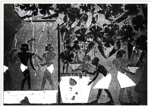
A vineyard scene from the Tomb of Apy, Thebes, 19th Dynasty The Israelites would have had to work harvesting grapes and making wine as in this scene from ancient Egypt.