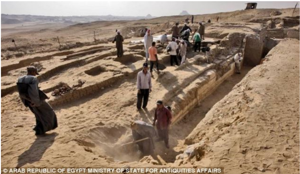
ARAB REPUBLIC OF EGYPT MINISTRY OF STATE FOR ANTIQUITIES AFFAIRS

Some of the 'cures' composed of 600 drugs and 800 procedures, developed by the ancient physicians - such as applying direct pressure to cuts - are still used today.