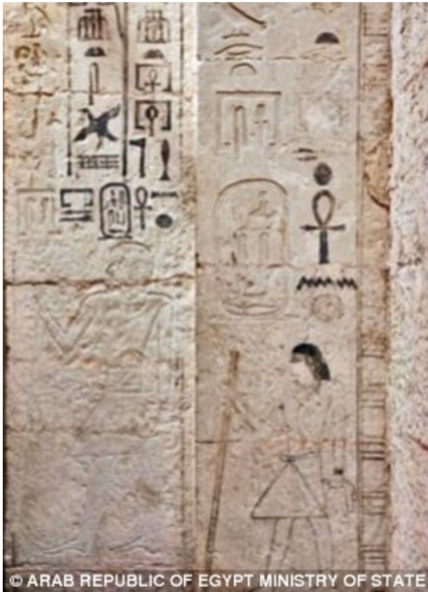
The large door covered in hieroglyphs and Images of Shepseskaf 'ankh himself

The door in the eastern part of the tomb also says that the medicine man was one of the most important royal physicians in Ancient Egypt at the time.