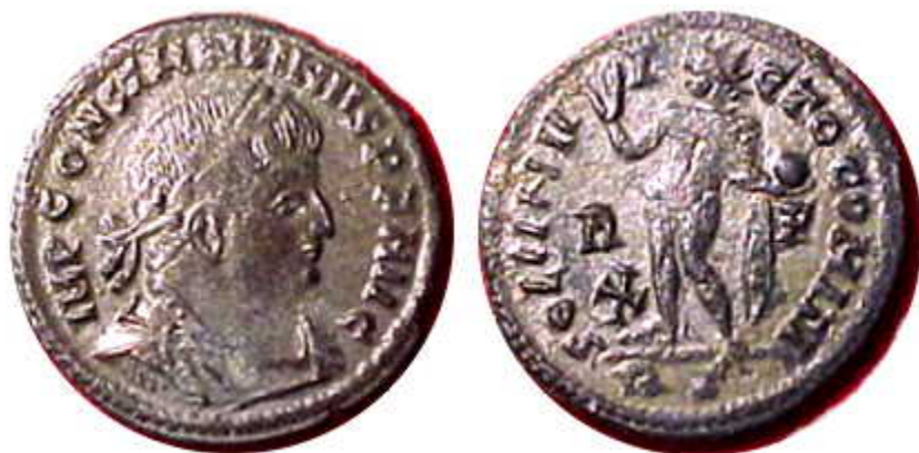
Above - coin of the pagan emperor Constantine I, inscribed on the reverse with SOLI INVICTO COMITI - Sol, Invincible Comrade (of Constantine ) with the sun god arrayed with solar crown. Note one hand raised in blessing, the other hand holding a globe. Below - coin of Pope Innocent XII dated 1698 showing Sol Invictus as Christ, inscribed IPSE EST PAX NOSTRA - He is our peace .

Here is one example of how the ancient Sun god became amalgamated into the Roman Church in the form of their Christ figure.