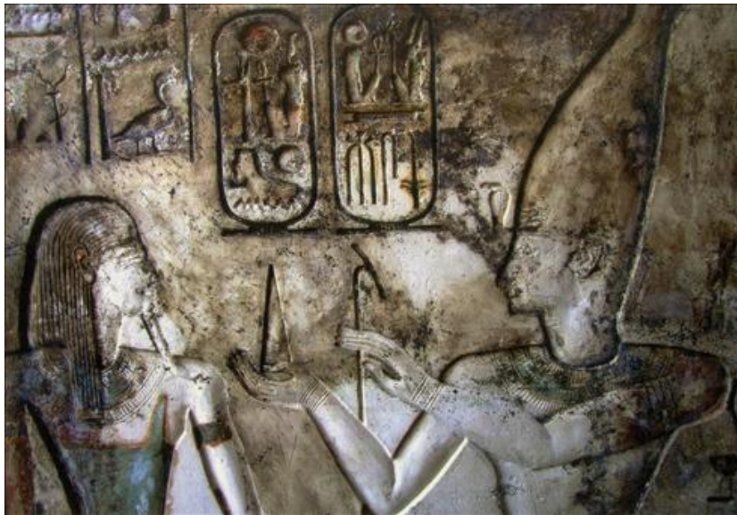
A handout picture released by Egypt's Supreme Council of Antiquities on April 21, 2009 shows carvings on a wall at an ancient temple in the Sinai peninsula. Egyptian archaeologists have unearthed carvings at four ancient temples in the Sinai peninsula which they hope will shed fresh light on one of the most obscure periods of Pharaonic history.

the ancient Egyptian army during the New Kingdom era to store wheat and weapons.