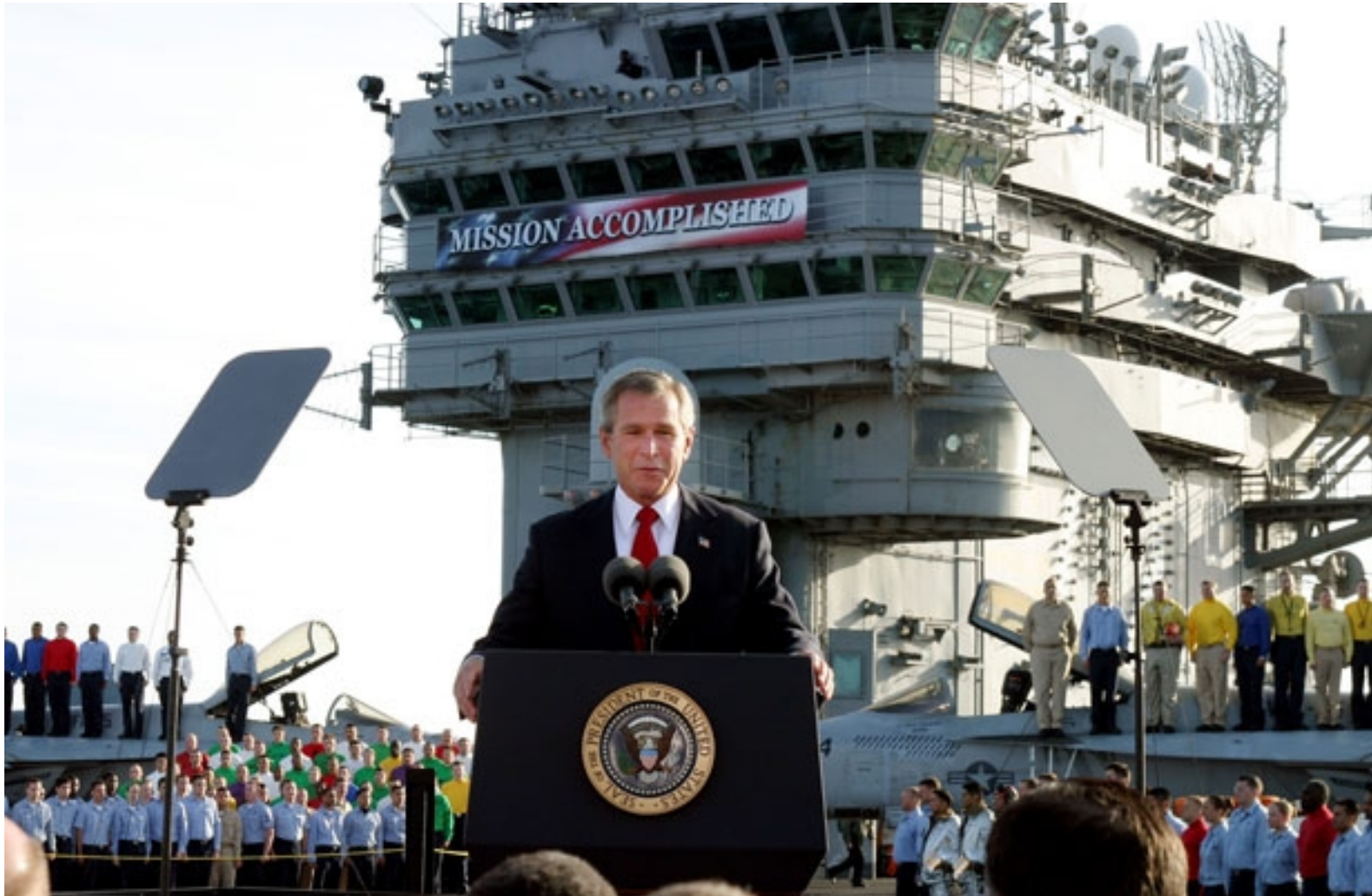
George W. Bush declares the end of major combat operations in Iraq aboard the USS Abraham Lincoln.

Masses of Americans got that message and cheered and sighed; "What a relief!"