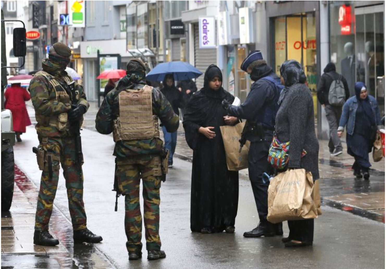
Belgian soldiers and a police officer control the documents of a woman in a shopping street in central Brussels, November 21, 2015.

Synagogues in Belgian capital closed on Shabbat for the first time since World War Two, Rabbi Avraham Gigi tells Israel's radio 103 FM.