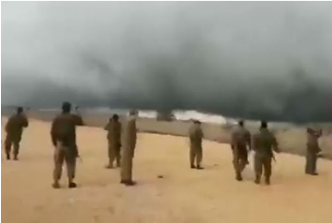
Many believe the storm was a sign from God

It is believed that the storm occurred last Thursday, December 1, at around 8am.