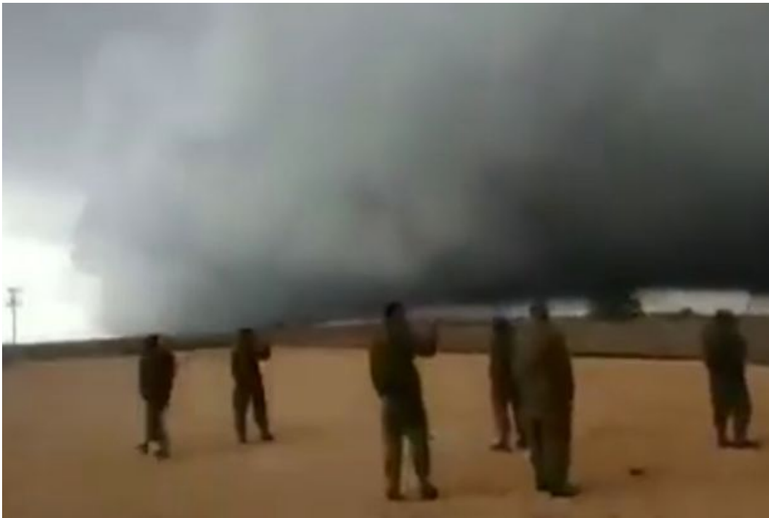
Some viewers believe the weather phenomenon was protecting Israel from ISIS

One Facebook user replied: Absolutely the divine intervention of God protecting Israel. Amen!"