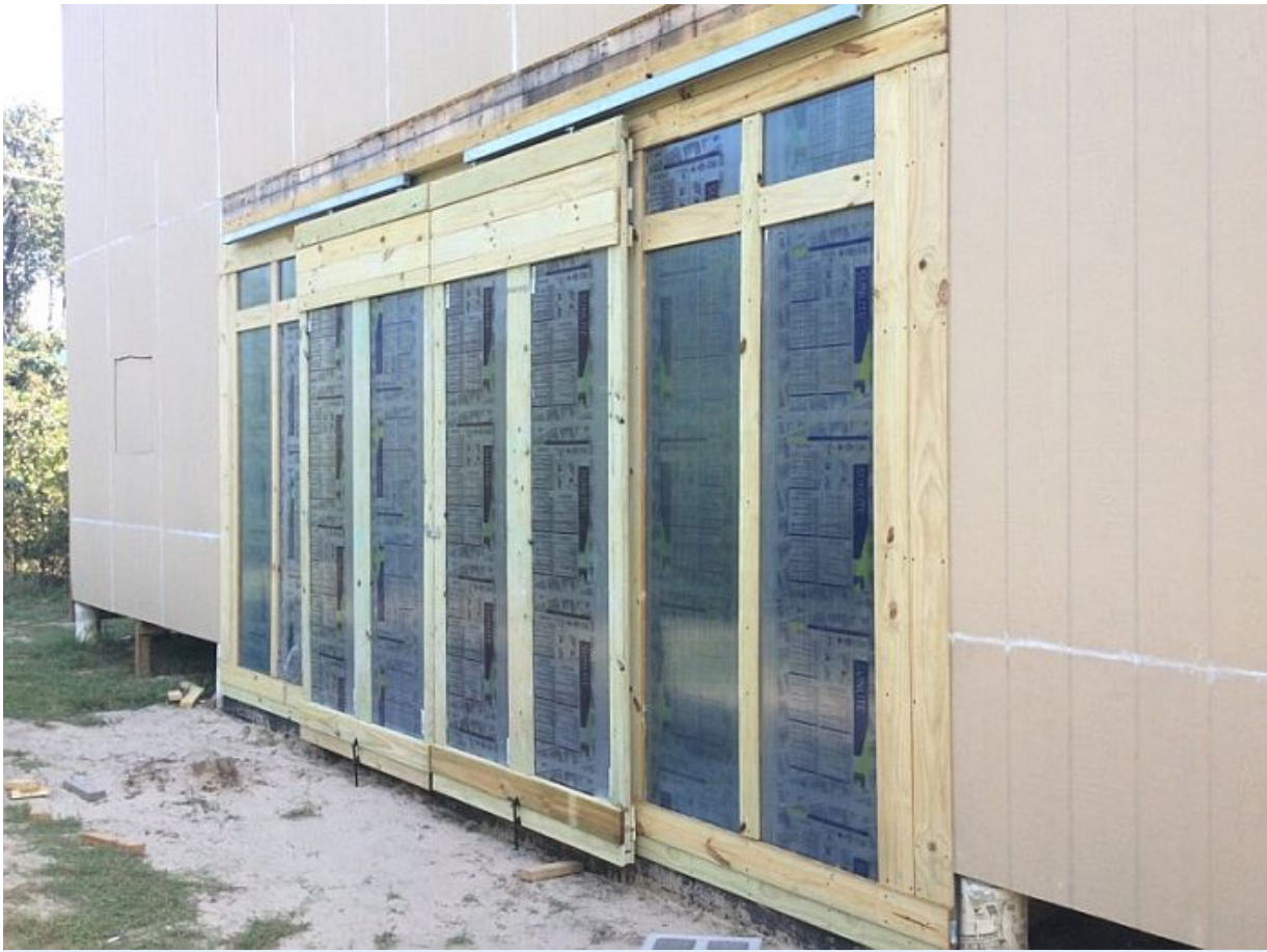
We just finished installing these sliding doors on the back of the shop!

Thanks to the prayers and the help of our partners, we have kept moving ahead. We continue to need financial support to finish the project. If you would like to help with that, send your offering to: