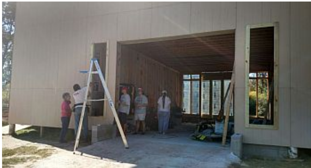
Working on front of shop.

We haven't shared about our Tsiyon building project since before the 7th month. We've come a long way since then. Here's what we've been doing lately!