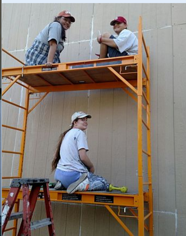
Prep for painting.