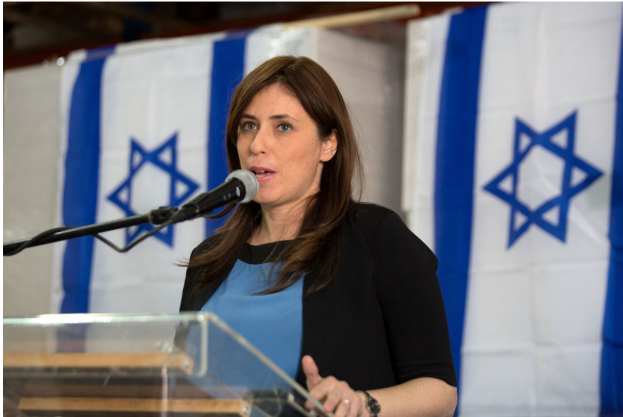
Israeli Deputy Foreign Minister Tzipi Hotovely

Reprint: New York Post, December 25, 2017