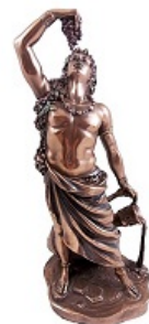
Dionysus, god of wine and bread.