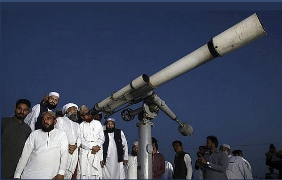
Clerics of Pakistan's Moon Sighting Committee search the sky with a telescope for the new moon that signals the start of the Muslim fasting month of Ramadan, in Karachi, May 5, 2019.