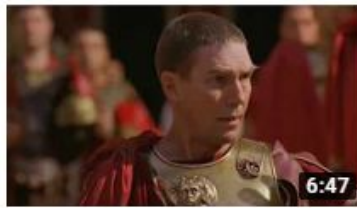
Who Killed Jesus? - News Bytes

Tsiyon Road Radio Click this YouTube Channel