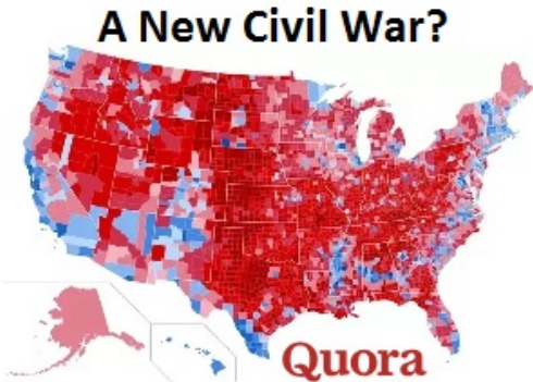
Map of the 2016 electoral results: Republican in red, Democrat in blue