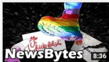
What is right? - News Bytes

Tsiyon Road Radio Click this YouTube Channel