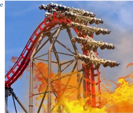
Buckle up boys and girls, the next decade will be a wild ride!

The latest Global Risks Report (2019), published each year by the World Economic Forum, lists ten possibilities, as they see it. The Report explains; "As the world becomes more complex and interconnected, incremental change is giving way to the instability of feedback loops, threshold effects and cascading disruptions. Sudden and dramatic breakdowns—future shocks—become more likely. In this section, we present 10 such potential future shocks." Their list: