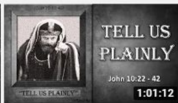
Tell Us Plainly

You can tune in to Tsiyon Road from around the world by using one of the free apps on you mobile device from