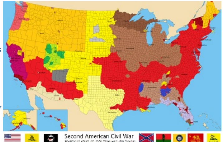
Possible outcome showing factions after a new civil war in USA.

The United States is divided by many factions, and this is seen by many as a growing threat to the union of the country. In fact, maps showing the division of the country after a new civil war are becoming frighteningly common these days. For example, the map to the right, shows how the country might be divided up by the hypothetical civil war according to various factions. Factions are always a problem for every country and group.