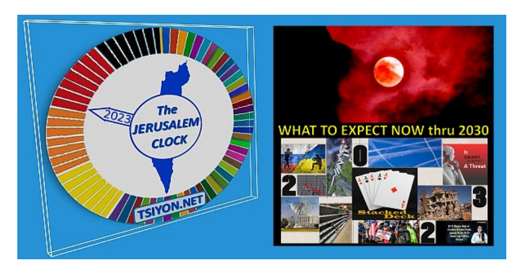
"This generation will not pass away until all things are accomplished." Luke 21:32