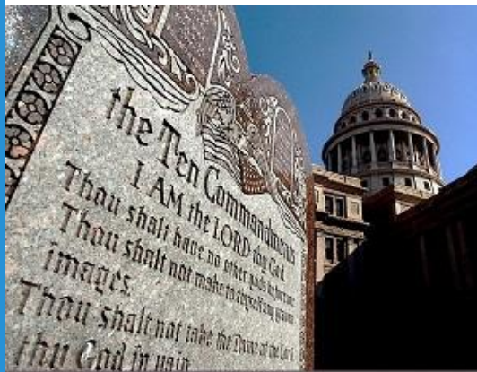
TEN COMMANDMENTS at the TEXAS STATE CAPITOL

Here in Texas the Ten Commandments are still displayed at the Capitol.