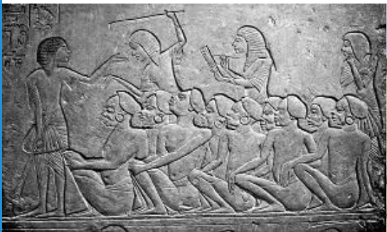
Ancient Egyptian slave market, with Nubian slaves waiting to be sold. Archaeological Museum, Bologna.

When we consider the vast power and dominance that Egypt exercised over their slaves, it becomes clear that only God Himself was/is greater, with the power to bring Egypt to their knees, to set His nation free.