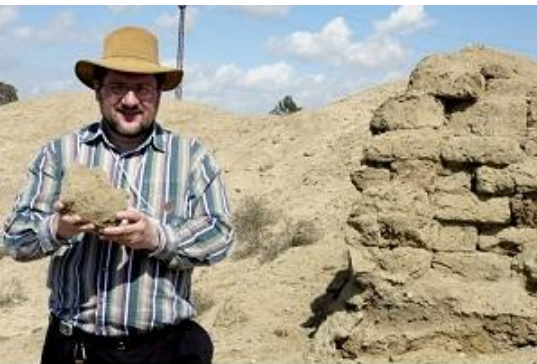
..author holding an ancient mud brick made with straw, at Succoth (Tell el-Maskhuta), dating to the time of the Exodus