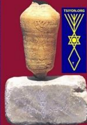
Nazorean Mikveh of James the Just

Live stream panel discussion tonight at Tsiyon.Net